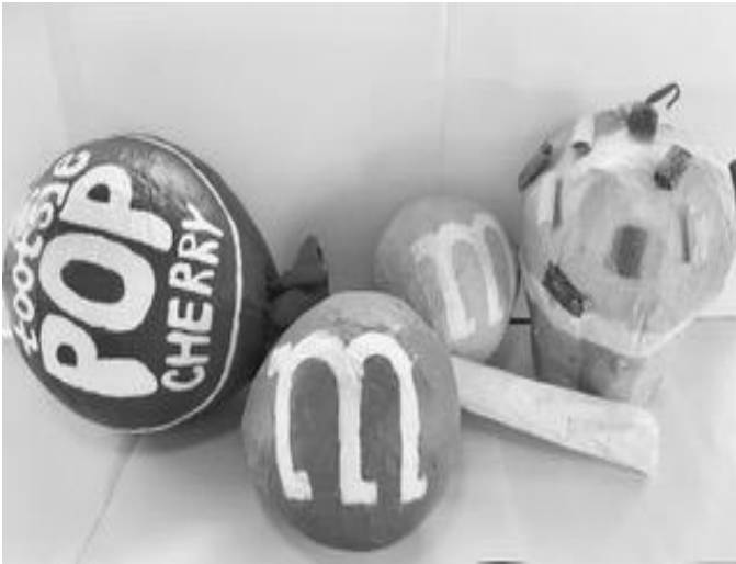
Pop Art by Zeuch's Students