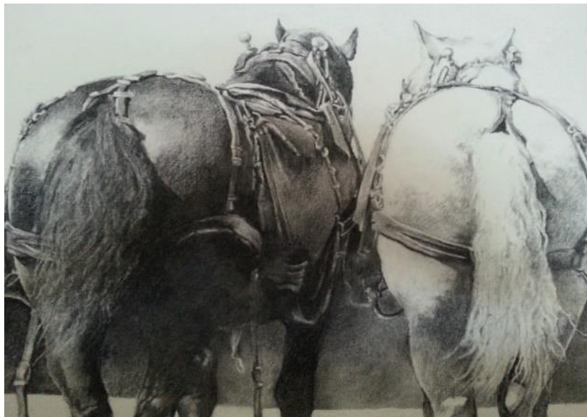
ART BY ELLEN ROTTSOLK