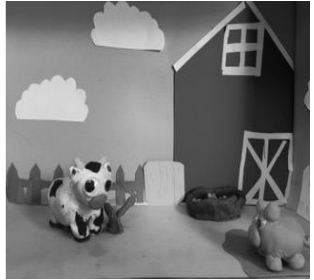
Clay Animation Art by Zeuch's Students