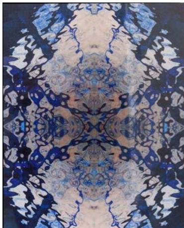
GRASS — BLICK AWARD