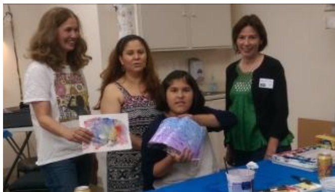
GLEN ELLYN CHILDRENS' RESOURCE CENTER RECEPTION