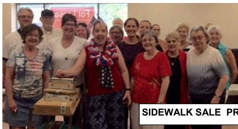
SIDEWALK SALE PREP DAY