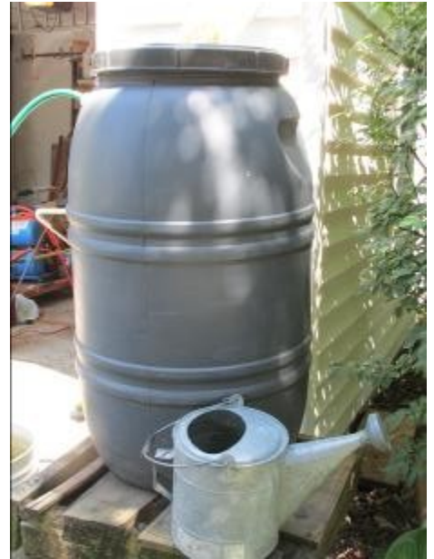
PHOTO: Did you know that rain barrels are made using recycled food barrels shipped in from Europe, containing pickles, olives or other small food items?

We will paint 10 rain barrels. Nature inspired themes in any art style should be a great look. Partner up and join us on Aug. 24 th at 10:00am at the annex . Sign up at the DPAL desk, (630-653-7090) sharing your names, (partner can be a non-member), phone numbers & emails. More information will be emailed to you later in August. All paint will be supplied....just bring your brushes and ideas. Primed & background painted barrels will be ready for your artistic efforts. Lunch will be provided on that day.