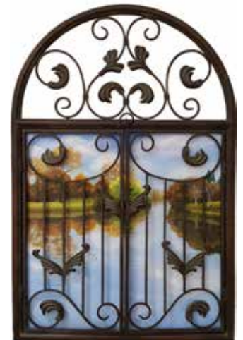
Lyn Tietz, Brook Forest